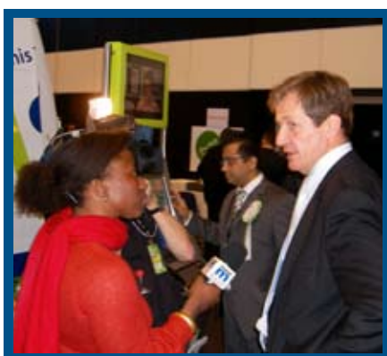
Former Press Secretary to Tony Blair, Alastair Campbell, was interviewed at the istop stand during the Labour Party Conference.